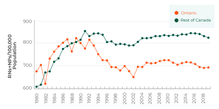
RNs+NPs/100,000 population: Ontario vs. rest of Canada

This chronic policy driven RN understaffing has had longstanding detrimental impacts on nurse wellness.