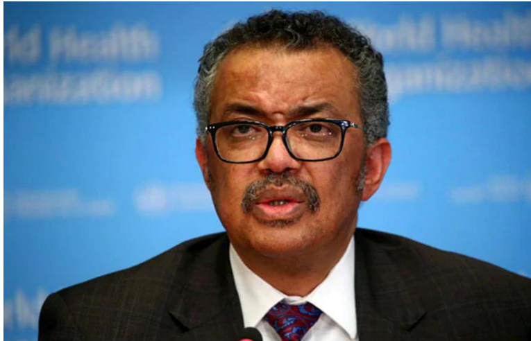
Tedros Adhanom Ghebreyesus also noted that the basic problem of vaccine inequity was a lack of sharing.

The world is at risk of 'vaccine apartheid'