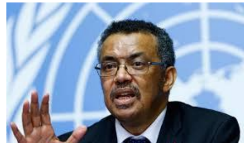
Dr Tedros Adhanom Ghebreyesus Tedros World Health Organization’s Director General

“If there’s one thing we have learned, it’s that no region, no country, no community and no individual is safe until we are all safe...More than 80 per cent of the world’s vaccines have gone to G20 countries; low-income countries, most of them in Africa, have received just 0.6 per cent of all vaccines.”