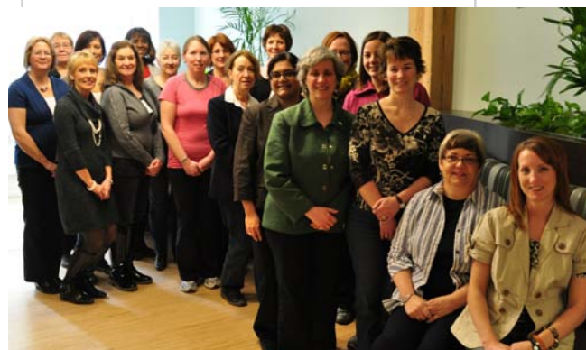
RN coordinators from the 10 Prevention of Elder Abuse Centres of Excellence sites across Canada at the RNAO during their four-day orientation session.

Stay tuned for more information on the project and the release of resources to homes in Ontario and across Canada.