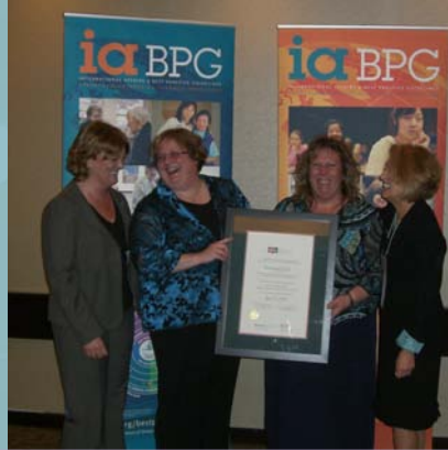
Extendicare York receives their Best Practice Spotlight Organization Designation in April 2009.

Extendicare York (Sudbury, Ontario) led the way as the first long-term care home designated as a BPSO ® .