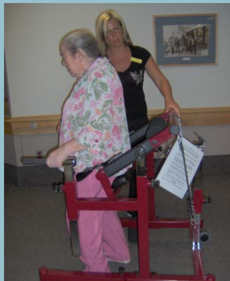
One of FMH's residents in the bungee trainer for their falls prevention program

Currently, there are 16 BPSO ® candidates in Ontario, representing a broad spectrum of health care settings, including large and small hospitals, home health care agencies, public health departments, a regional candidate (Hamilton Niagara Haldimand Brant LHIN), a community health centre, the first